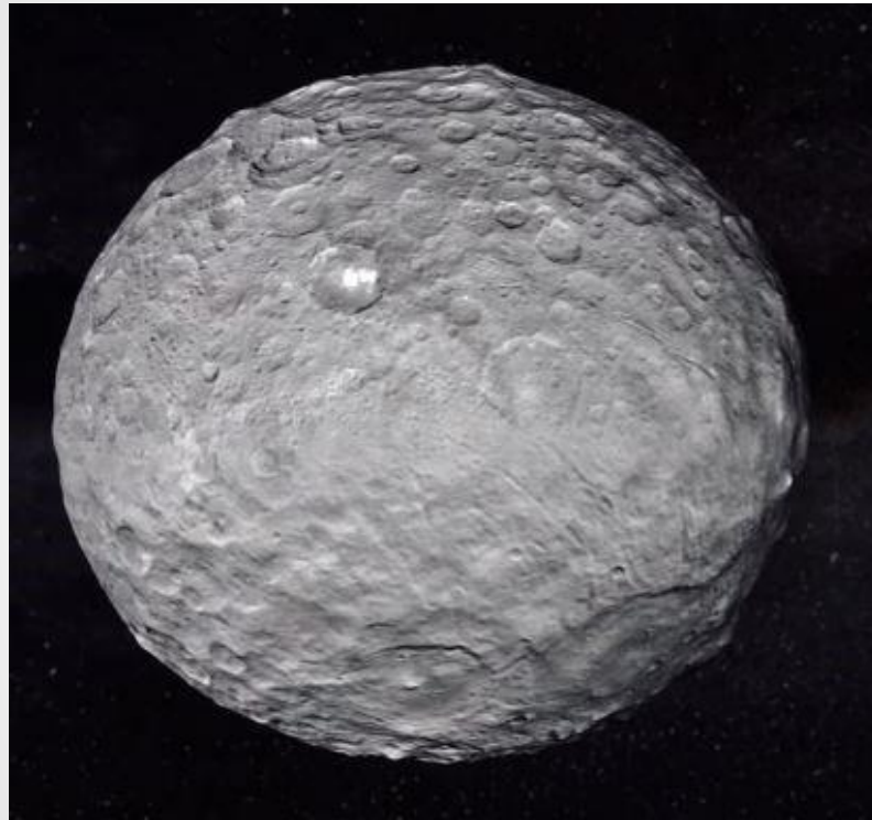
Image of the asteroid Ceres, taken by NASA's Dawn spacecraft. The mysterious, bright region is thought to be composed of salt deposits.